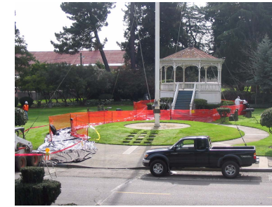
Removing Lead in Soil from Lead-Based Paint around Gazebo in Farragut Park