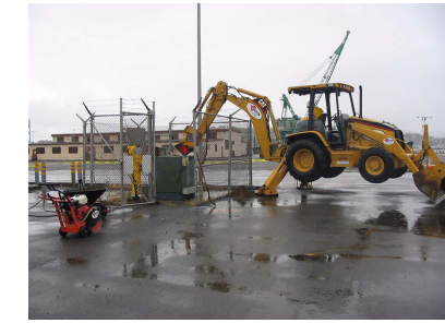
Removing Contaminated Concrete at Transformer Pad