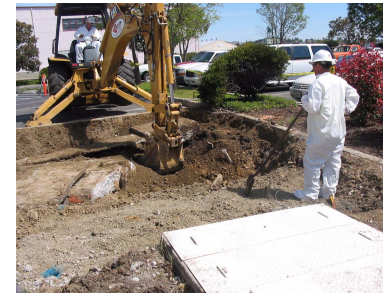
Removing Transformer Pad and Contaminated Soils at Former Transformer Location east of Building 459