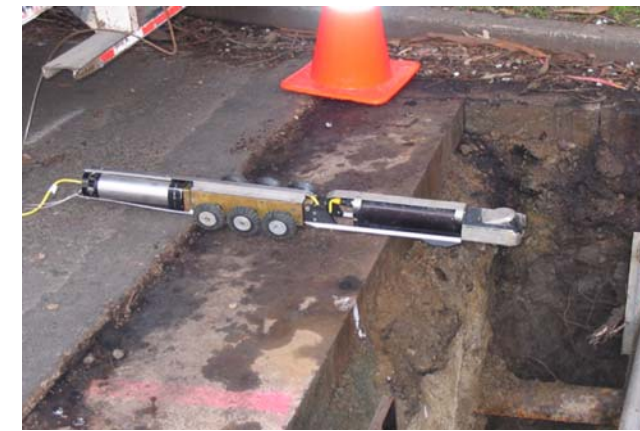
FOPL Video along 7th Street