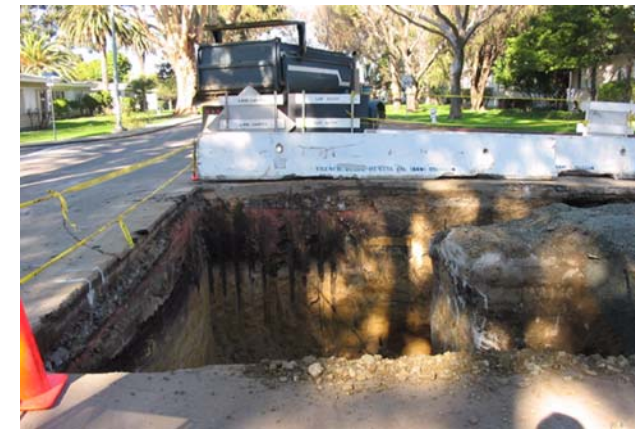
Excavation at OR15