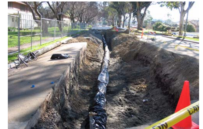
FOPL Excavation along Azuar