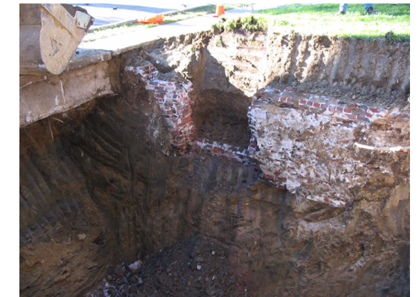
Excavation at OR-16