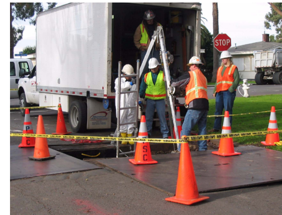
Video Survey at FOPL along 7th Street