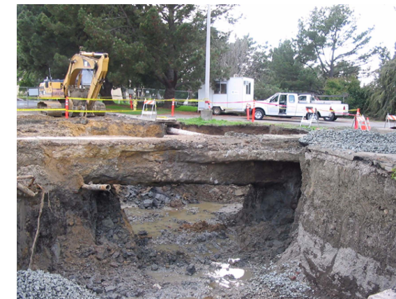
Excavation at Building H74