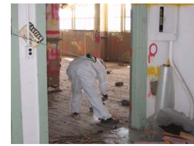
Floor removal in Building 680