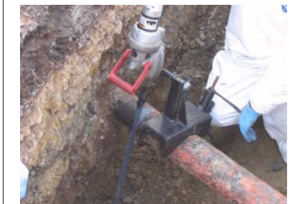
Sawcutting FOPL Segment in Preparation for Vacuum Testing of the Pipeline