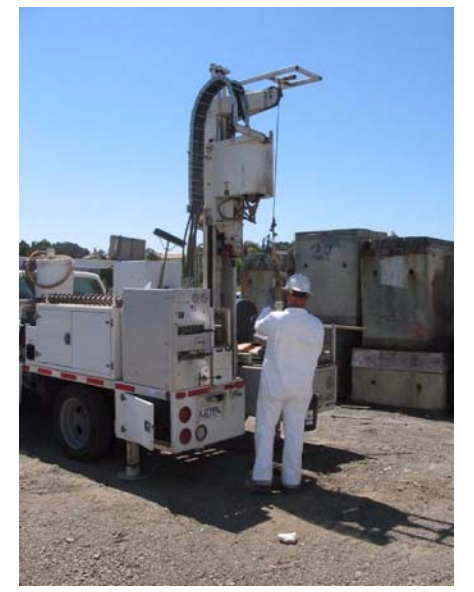
Preparing to install groundwater monitoring wells