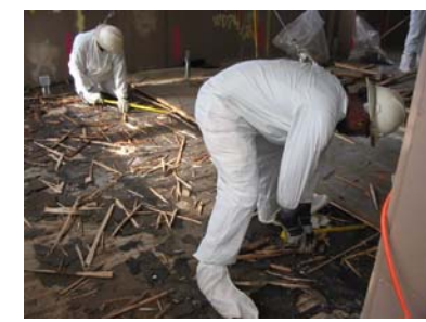
Floor removal in Building 680