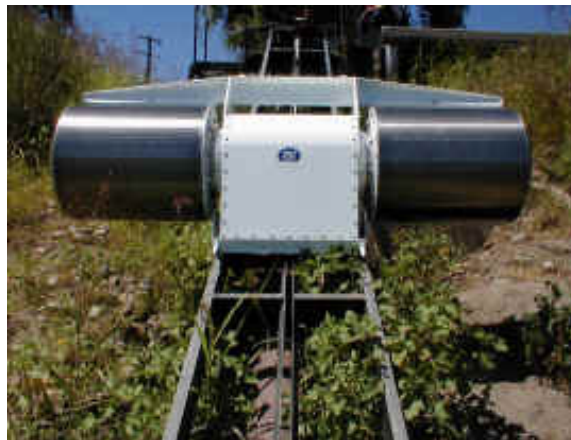
Figure 1 – Example of Intake Screens, Inc. Brushed Cylinder Screen

In order to meet the above described resource agency requirements when using self-cleaning screens, the contractor will be required to utilize brushed cylinder screens manufactured by Intake Screens, Inc. (ISI) of Sacramento, California, or equivalent. The brushed cylinder screen shall be installed such that the long axis of the cylinders is parallel to the flood and ebb currents.