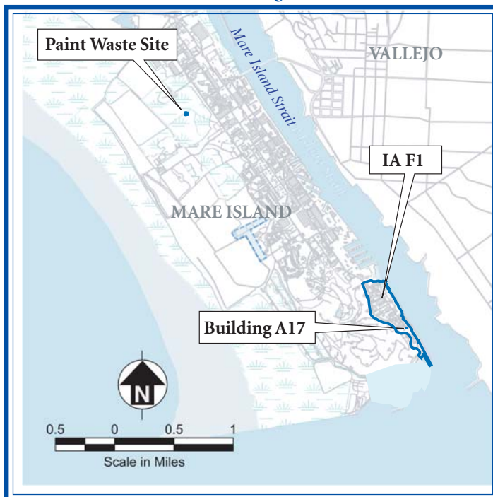
Field Work Investigation Areas