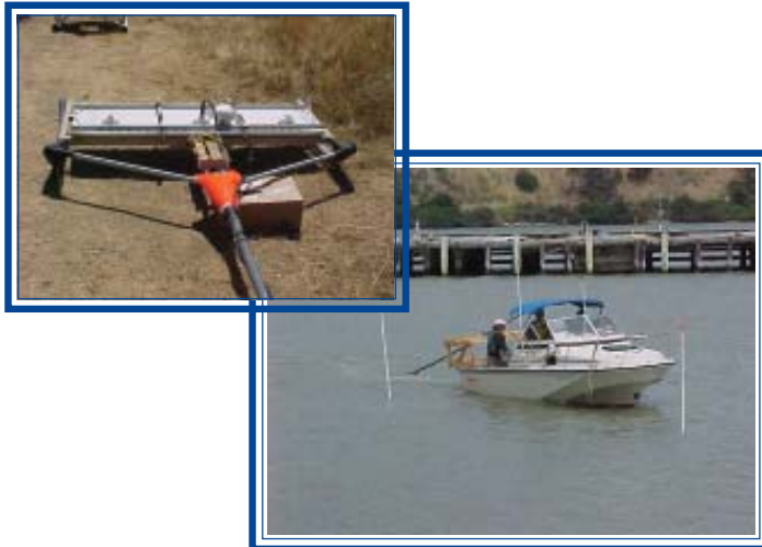
In June, the geophysical survey for underwater munitions at the South Shore was completed. Here we see the sensor, and contractors pulling the sensor behind the boat, to search for metallic anomalies.