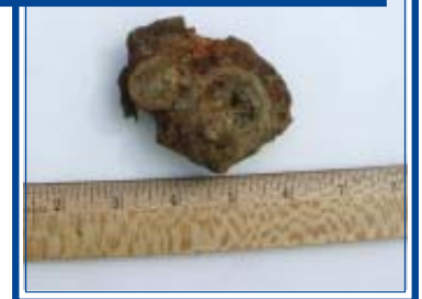
Field Work Investigation Areas

A contractor screens for radium at the Marine Corps Firing Range (above). This is an example of a small radium button found at the site (right).