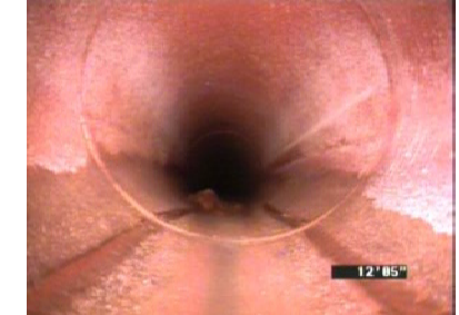
IR14 Industrial Waste Water Pipeline along Azuar Drive