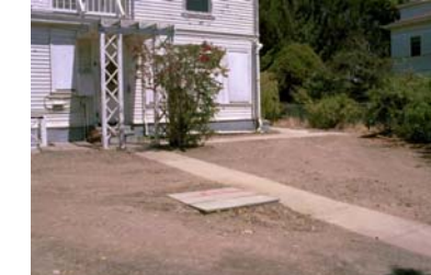
Backfilled Area following Soil Removal Soil Removal Action West of Azuar Drive - Investigation Area D1