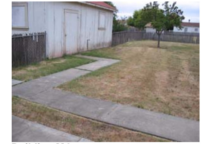
Building MO Planned Soil Removal Action East of Azuar Drive - Investigation Area D1