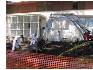
Q Quarters Soil Removal Action East of Azuar Drive - Investigation Area D1