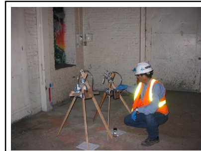
CH2M HILL prepares to conduct indoor air sampling in Building 84, the former Brig.