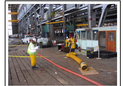
CH2M HILL subcontractors prepare for work in Building 680