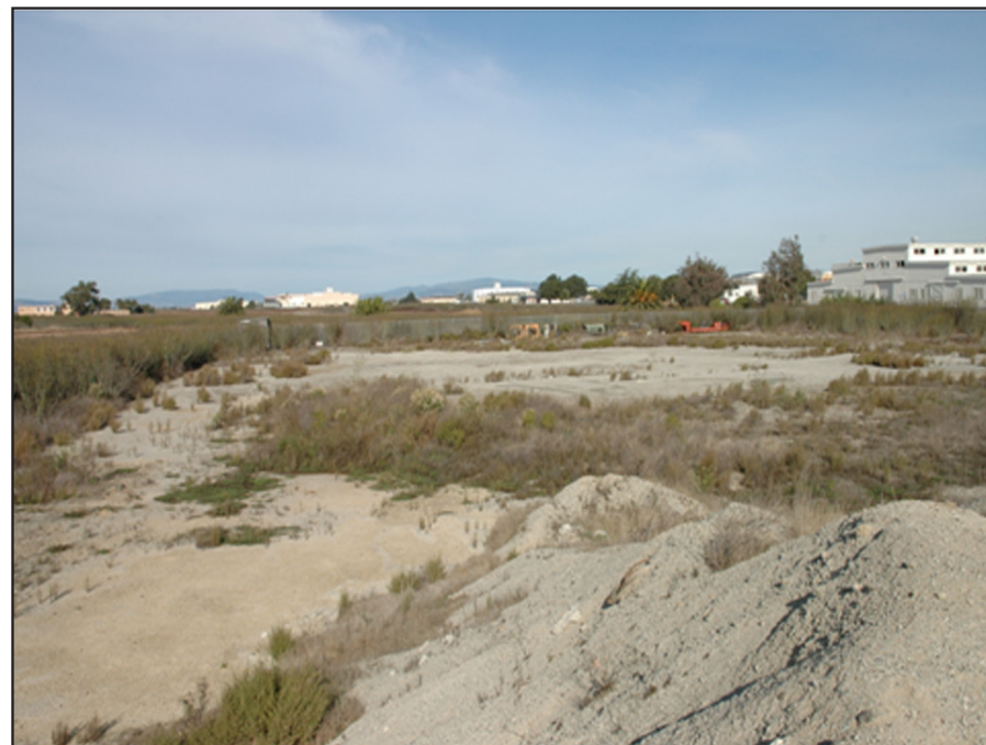
View of CTA looking to the north

Alternative 3 – Excavation/Offsite Disposal. This alternative would use excavation to remove impacted soil from the CTA. The excavated soil would be treated (if necessary) and disposed of at an offsite facility. This alternative also would include installation of a lateral containment barrier consisting of a clay soil wall to address migration of TPH (if necessary).