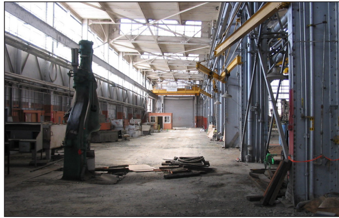
Interior of Building 386.

Alternative 4 – Excavation/Offsite Disposal of the Steel Grate and Dirt Floor Areas, Encapsulation (Existing Floor), Long term Groundwater Monitoring (as necessary), and Implementation of an LUC. This alternative includes excavation and offsite disposal of lead- and PCB-impacted soils in the Steel Grate Area. It also includes excavation and