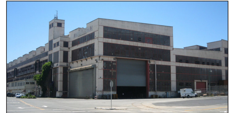
The Exterior of Building 382/386/388/390 superstructure.