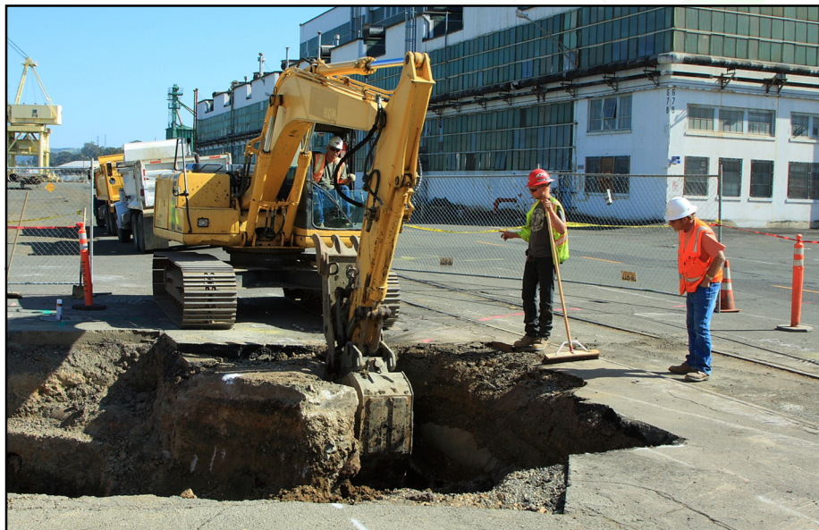
Soil Removal around Subsurface Utility and FOPLB290