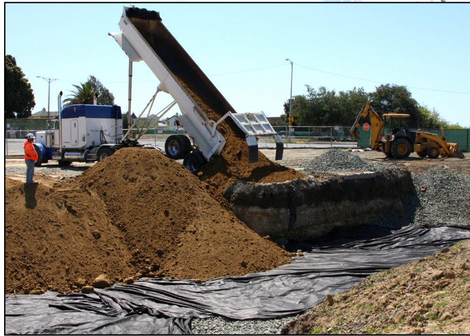
Backfilling at UST 231 Area April 3, 2009