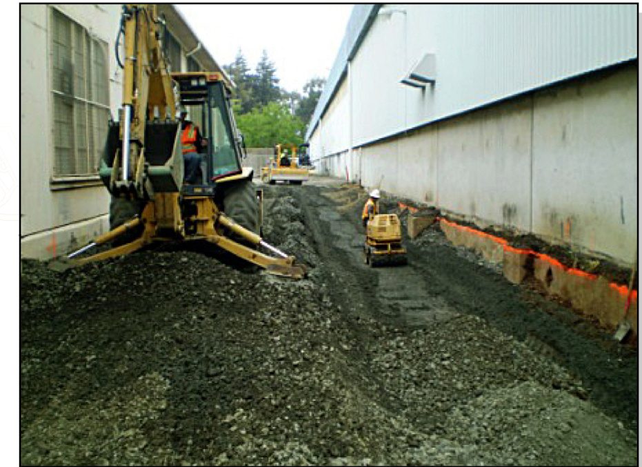
Backfilling and compacting pipe trench located between B1310 and B206 April 23, 2009