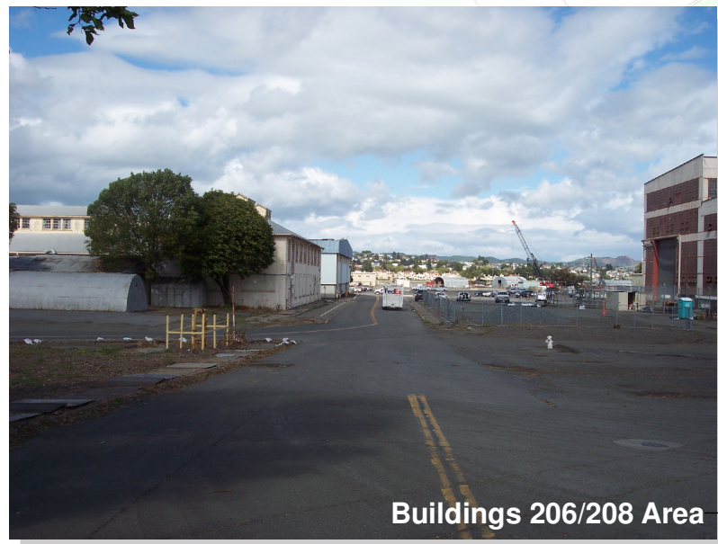
Buildings 206/208 Area