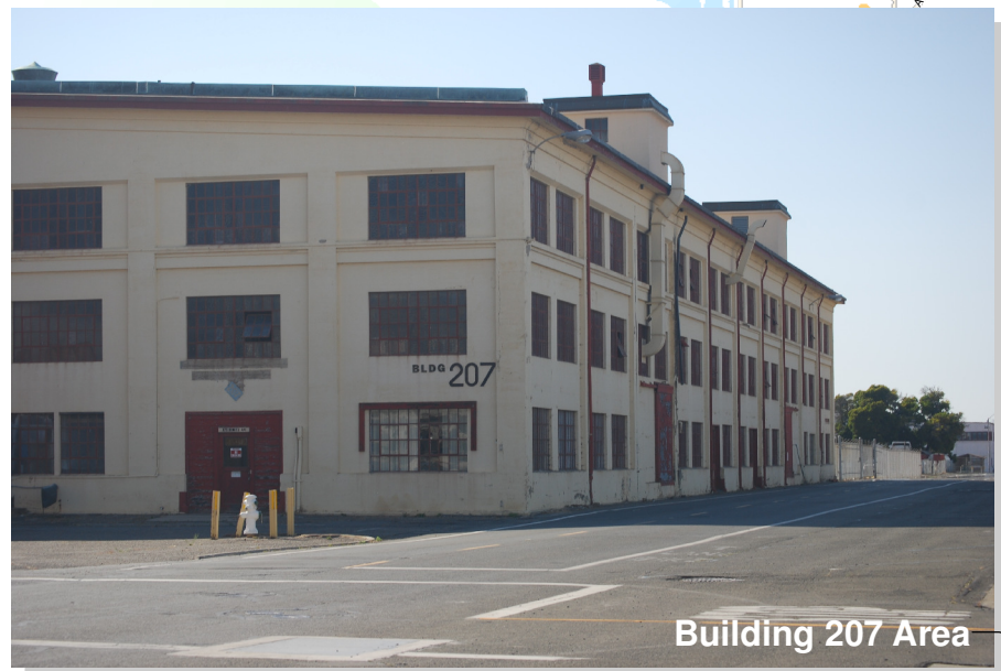
Building 207 Area