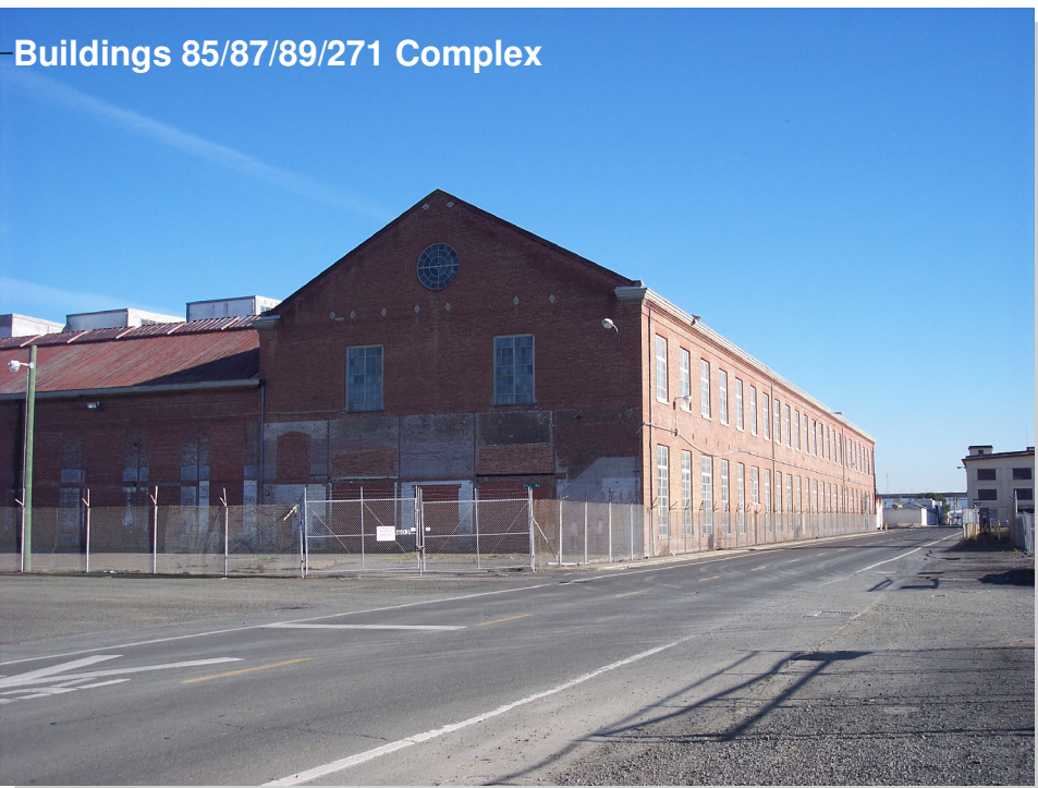
Buildings 85/87/89/271 Complex