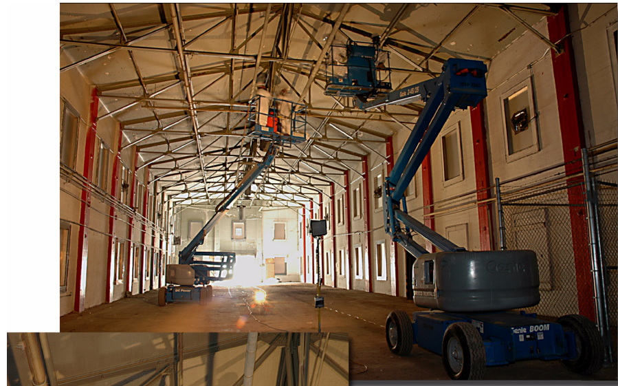
Workers Remove Dust from Surfaces in Building 84A using High Efficiency Particulate Air (HEPA) Filter Vacuums