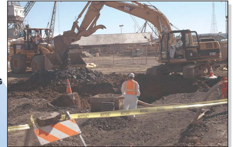
UST 742: Excavation continues to the south and east of Former UST 742