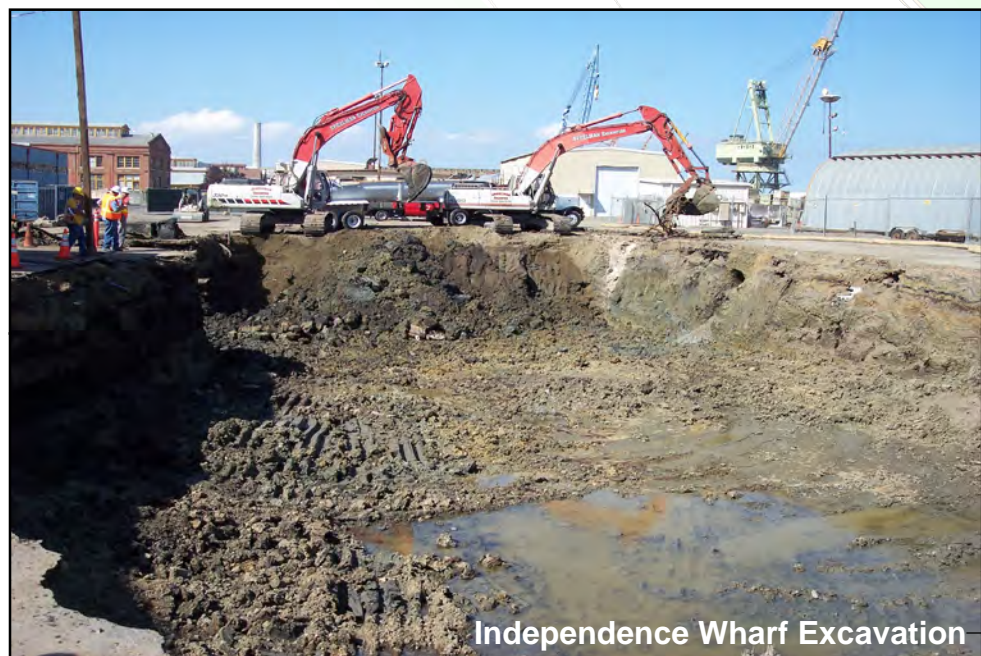
Independence Wharf Excavation