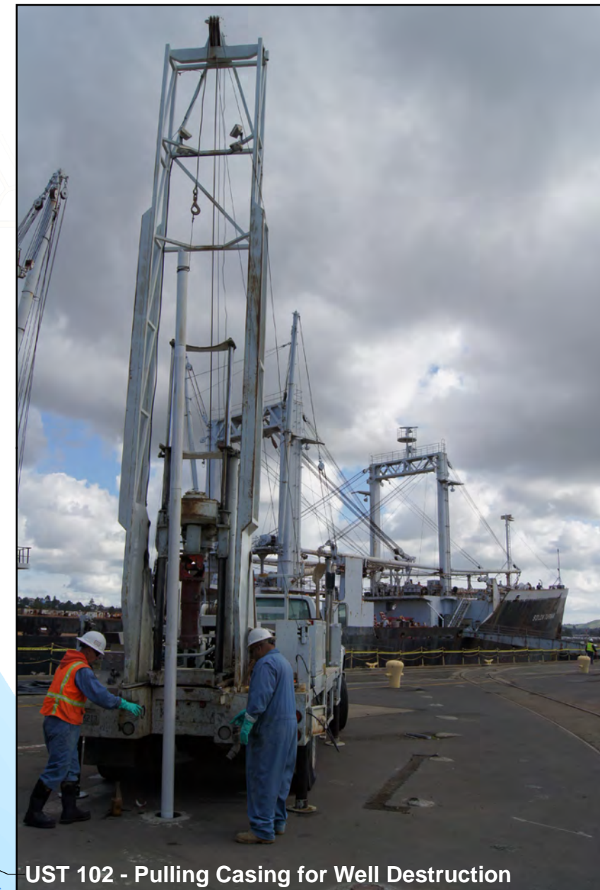
UST 102 - Pulling Casing for Well Destruction