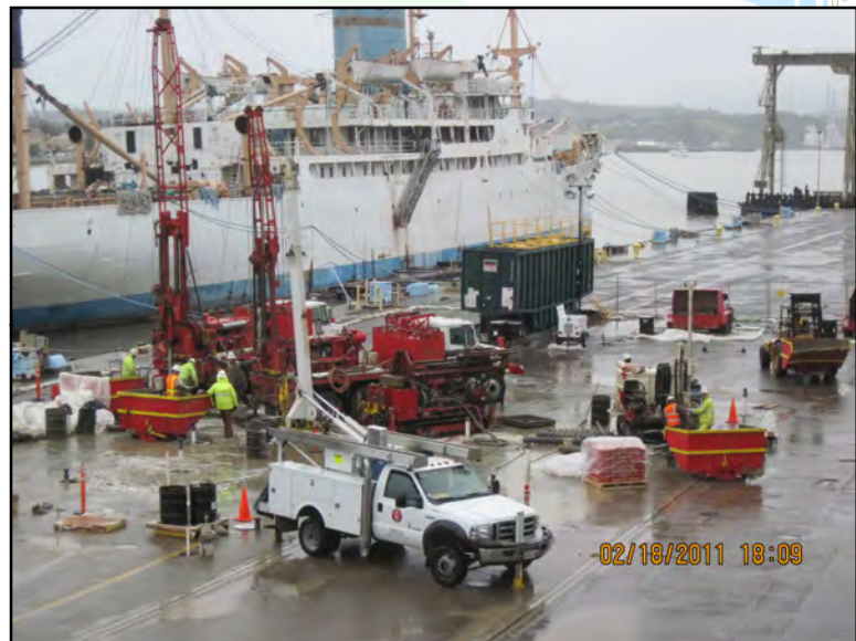
IR15 Drilling for Remedy Implementation