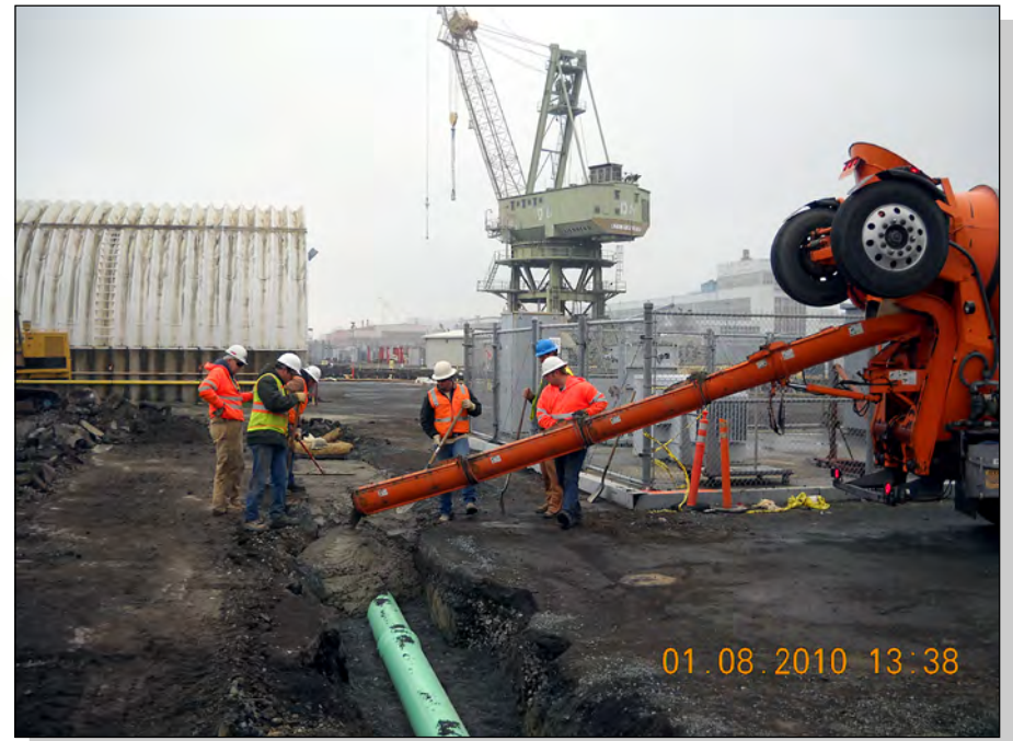
Installing Shallow Storm Water Pipeline