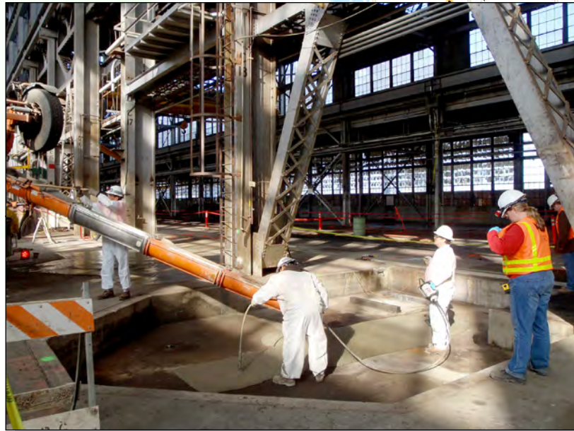
Pouring Slurry Backfill in Shallow Bays