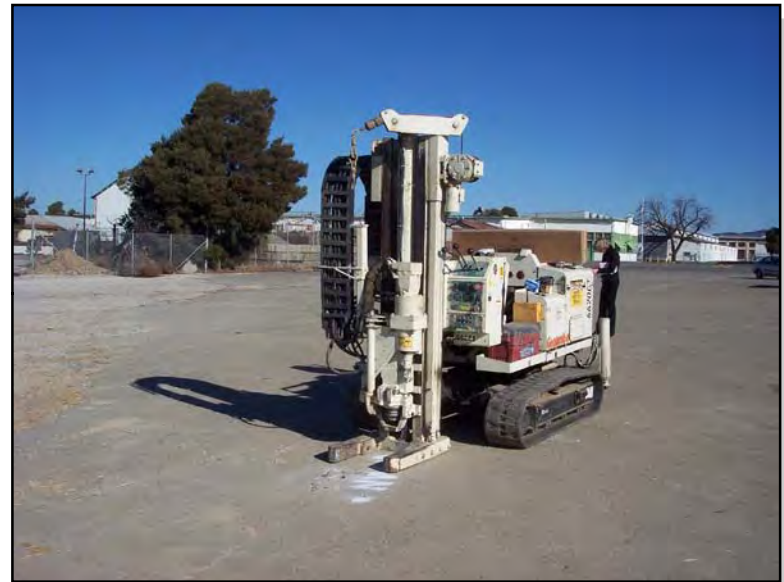
Building 637 Area Investigation