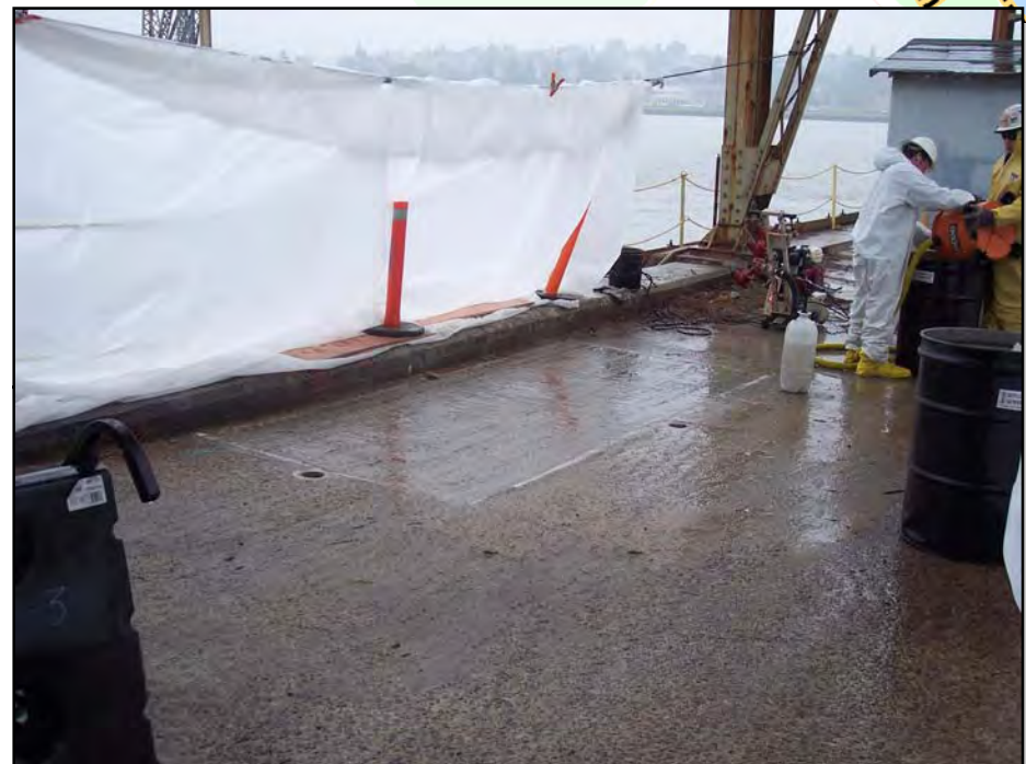
Building 1304 UL#01 Remedial Action