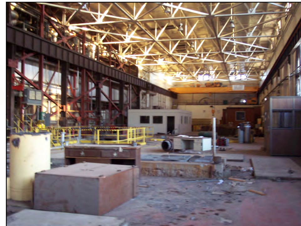
Interior of Building 121 Abatement of Hazardous Building Materials