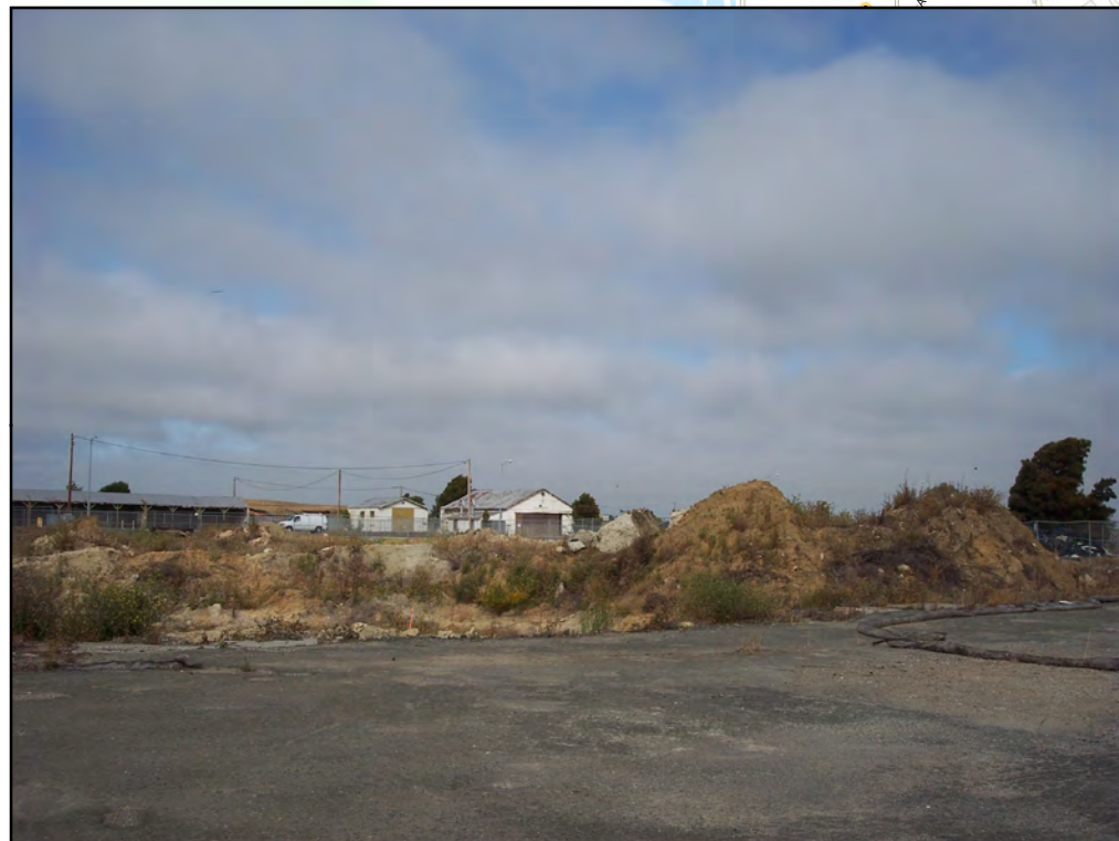
Building 637 Area - Site of Upcoming Characterization/Remediation