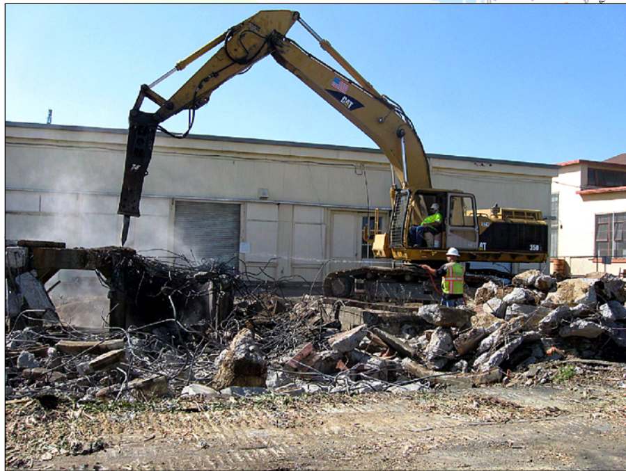
IR03 AST Containment Pad Demo