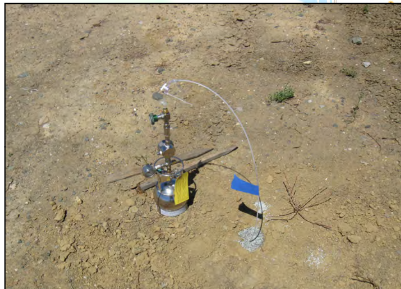
Duplicate QA/QC soil gas sample being collected in Summa for fixed lab analysis