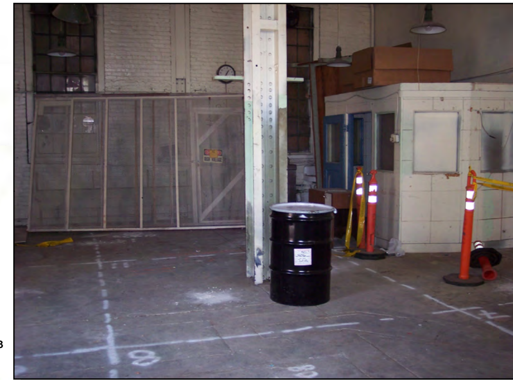
Building 69 PCB Sites UL#02 and UL#03 Floor Grid Sampling