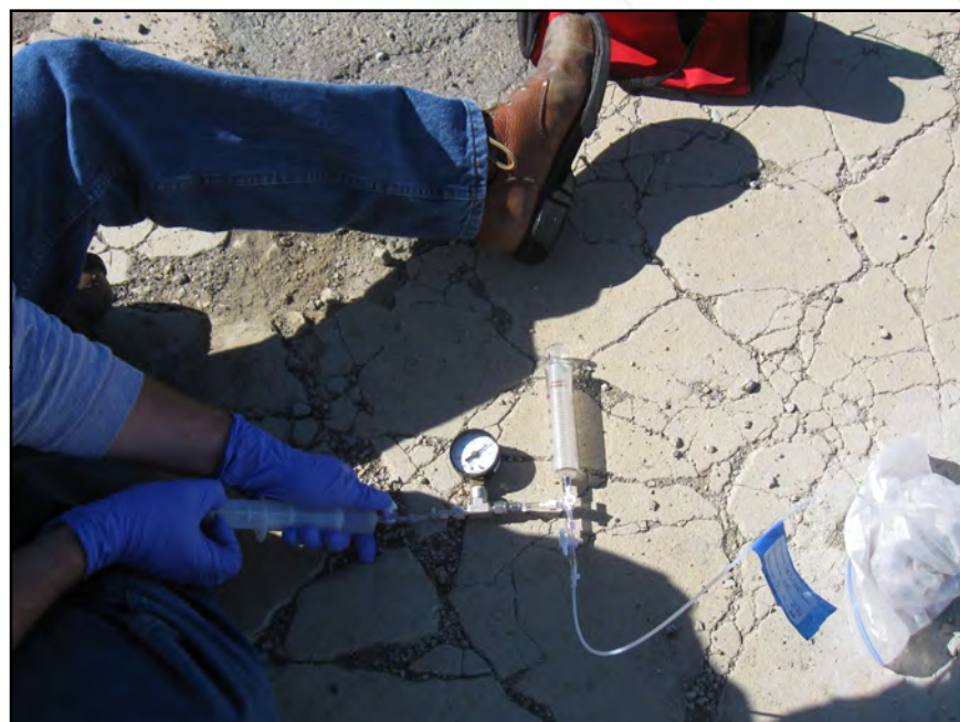
Sample purging syringe and extraction vacuum gauge being used before collection of primary sample