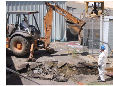
Investigative Trenching at Building 225 Investigation Area C1