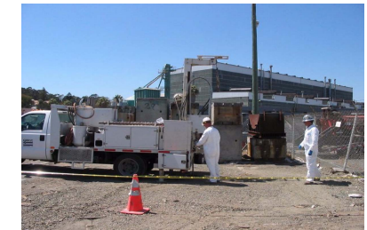
Soil Sampling at Ways 3 Investigation Area C3