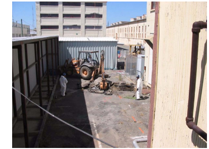
Investigative Trenching at Building 225 Investigation Area C1