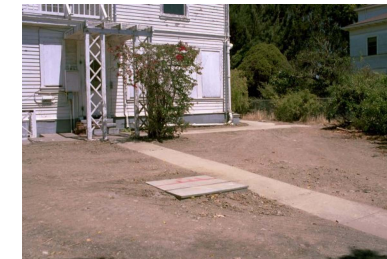
Backfilled Area following Soil Removal West of Azuar Drive - Investigation Area D1