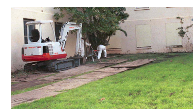
Soil Removal at Building H73 at Touro University January 20, 2005