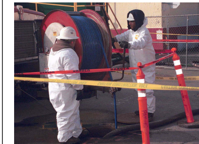
Flushing Equipment for Flushing and Cleaning of IR14