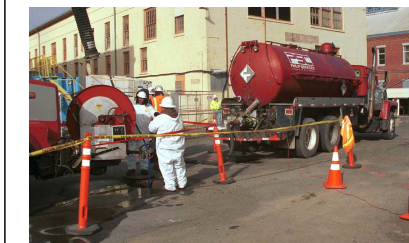
Flushing and Cleaning of IR14, the Industrial Wastewater Pipeline near Buildings 215 and 71