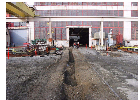
Removal of FOPL segments E2/4/B88 and E2/4/B388 on the south side of Building 386/388/390