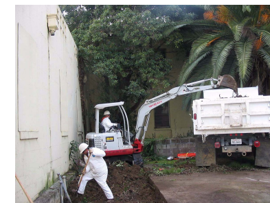
Soil Removal at Building H79 at Touro University January 20, 2005