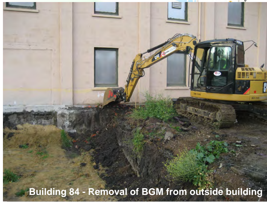
Building 84 - Removal of BGM from outside building