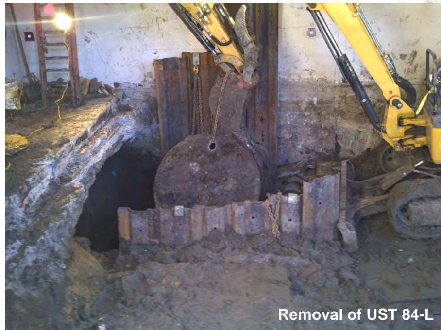
Removal of UST 84-L