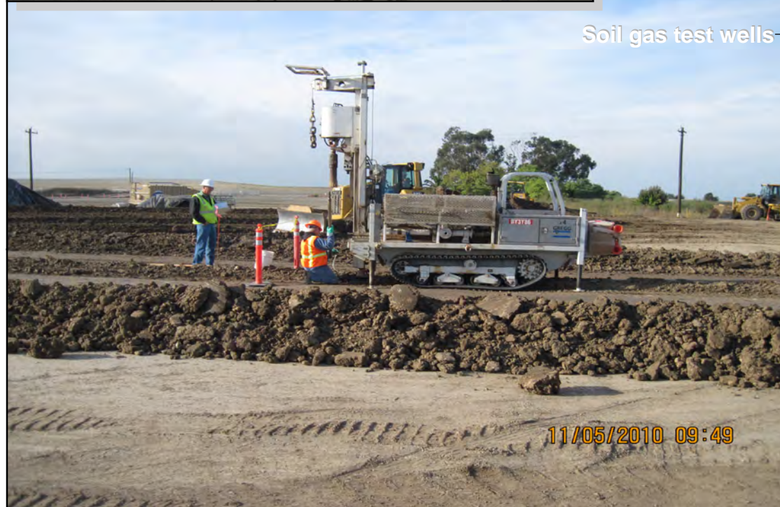
Soil gas test wells