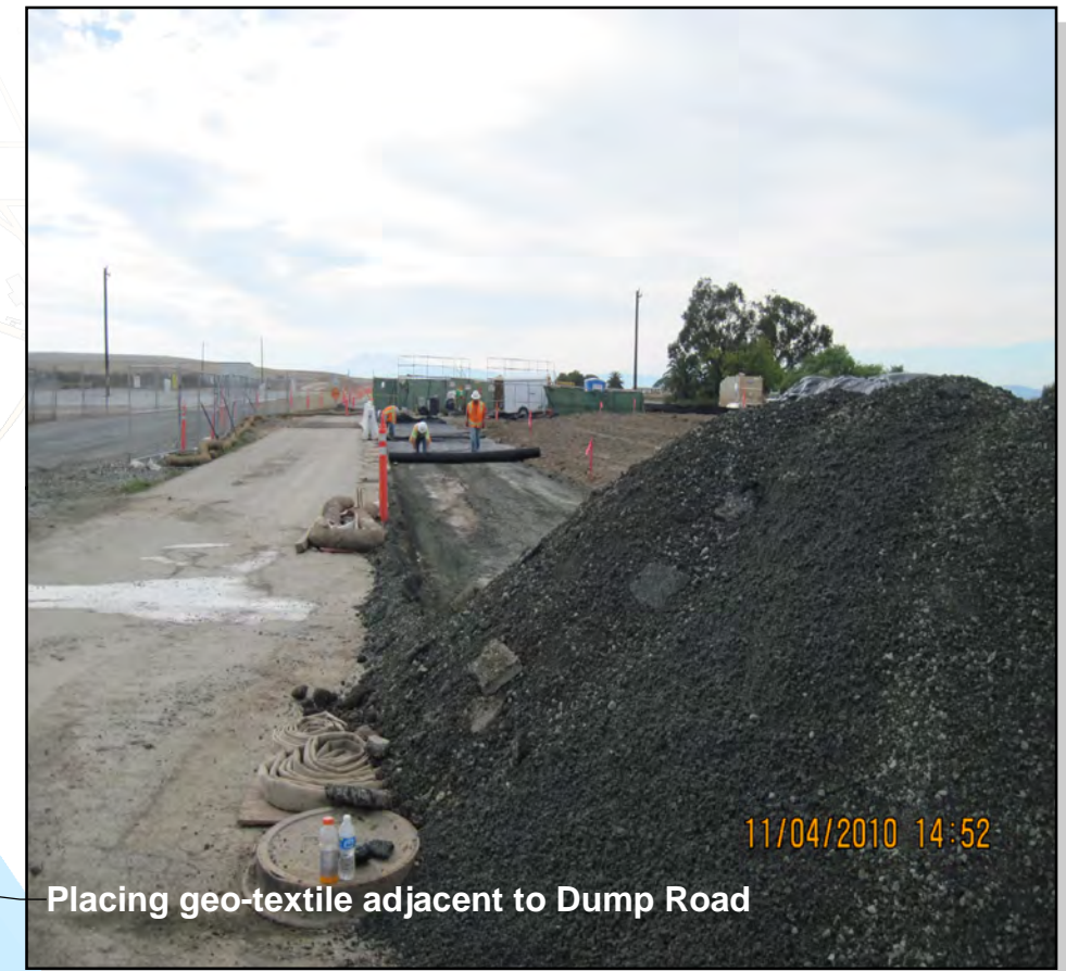
Placing geo-textile adjacent to Dump Road