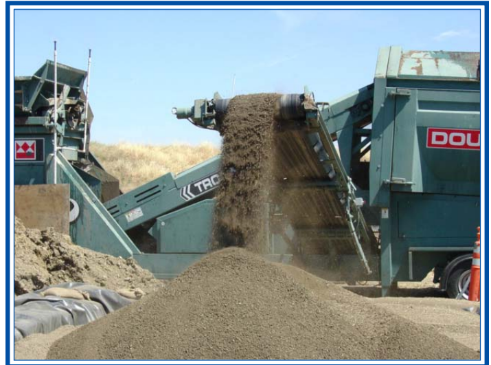
Dry screening for MEC from the historic outfall 4S using a Trommel

The U.S. Department of the Navy (Navy) prepared this monthly progress report (MPR) to report the progress and issues related to the environmental cleanup of the former Mare Island Naval Shipyard in Vallejo, California. This MPR does not cover cleanup work performed by the City of Vallejo and its developers, Lennar Mare Island and Weston Solutions, through the Navy's Environmental Services Cooperative Agreement. That work is reported separately by those parties. This MPR specifically covers the reporting period from April 30, 2004, through May 20, 2004. The information provided below includes updates on field work and removal actions; document submittals; and the progress of regulatory reviews, issues associated with Navy environmental programs, and remedial project manager (RPM) and Restoration Advisory Board (RAB) meetings.