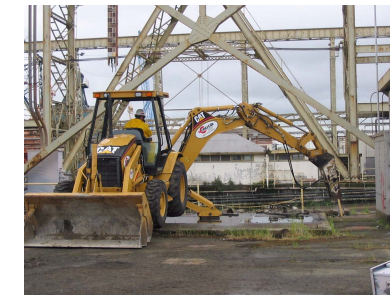
Removing PCB-Contaminated Concrete at Former Ways Area