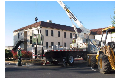
Removing Former Electrical Transformer at B459