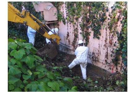
Removing Lead-Contaminated Soil at H73