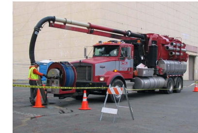
Close-up of Vacuum Truck used to Evacuate Manholes and Pipelines