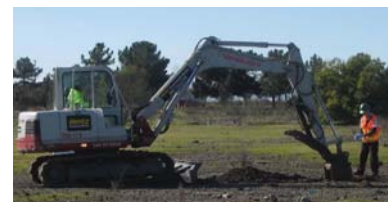
PCAP Field Work in January 2009

Preconstruction and survey activities required to implement the Petroleum Corrective Action Plan (PCAP) for the Former Northern Building Ways within Investigation Area (IA) A2 began in January 2009. Field work for the excavation and removal of 17 small areas (approximately 3,000 cubic yards) of petroleum contaminated soil will proceed pending suitable periods of dry weather.