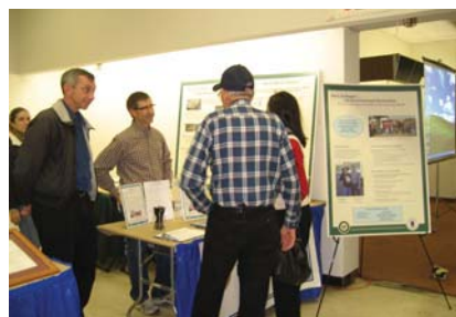
Navy talking to community members at the Flyway Festival in February 2009