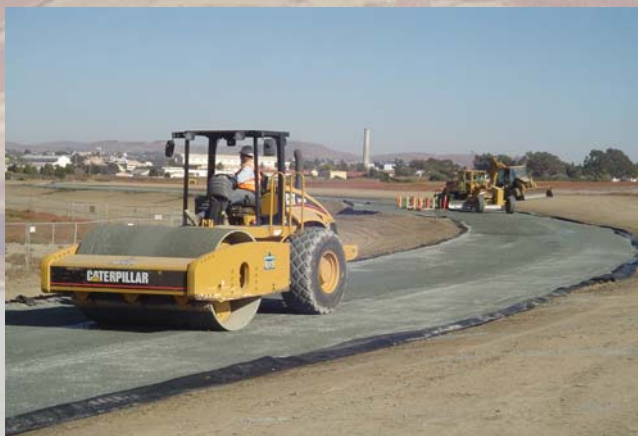
Installation of Perimeter Access Road for IA-H1 Containment Area

As noted last month, the schedule for completing the remaining portion of the cap has been extended into 2009 to allow consolidation of soil from the IR-05 site after receipt of the USFWS biological opinion. A portion of the perimeter access road is being installed along the completed portion of the cap.